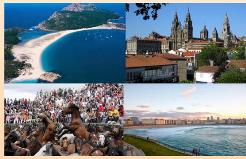
Cies Islands, Compostela, "Rapa das bestas", A Coruña