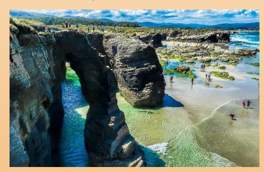
Las Catedrales beach