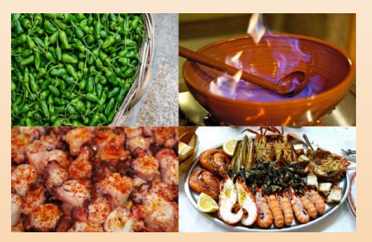
Little green peppers from Padron, Queimada, Octopus, Seafood

Some reviews on Pontevedra at The Guardian